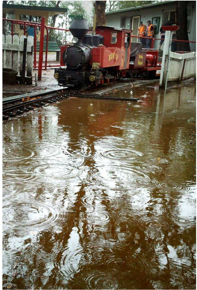
Bunyip waiting for the weather to ease.

The rain deterred most of the parties who left after the rain eased however a couple of the parties braved the wet and remained to the end.