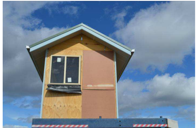
Signal Box waiting the fitting of the door

The second 5" track bridge has been installed and the track supports have been welded to the bridge structures. Work has commenced on the abutments to the bridges. Once the abutments are completed then the preparation of the roadbed can commence.