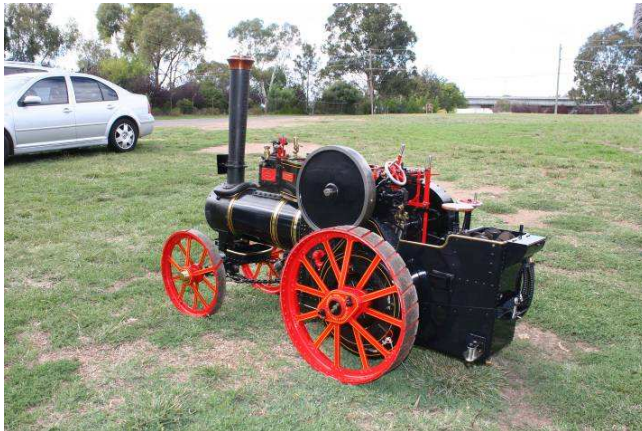
Eric Hines Traction engine.

One boiler was tested during the month. The boiler belongs to Eric Hines traction engine. No problems were found and the boiler passed with flying colors.