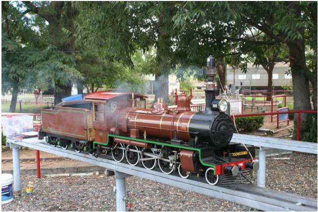
The C17 on the steaming bay