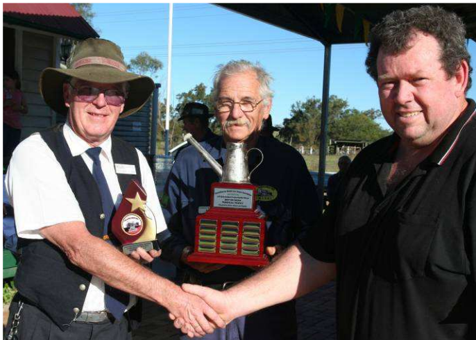
QR Workshop Manager presenting the prize for the best Loco