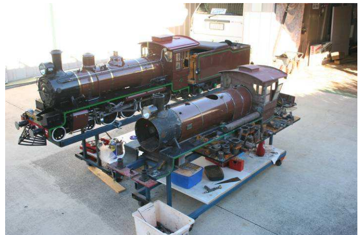
Two C17's together