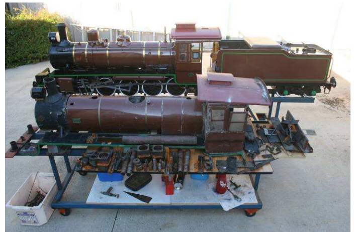
C17 966 and left over parts