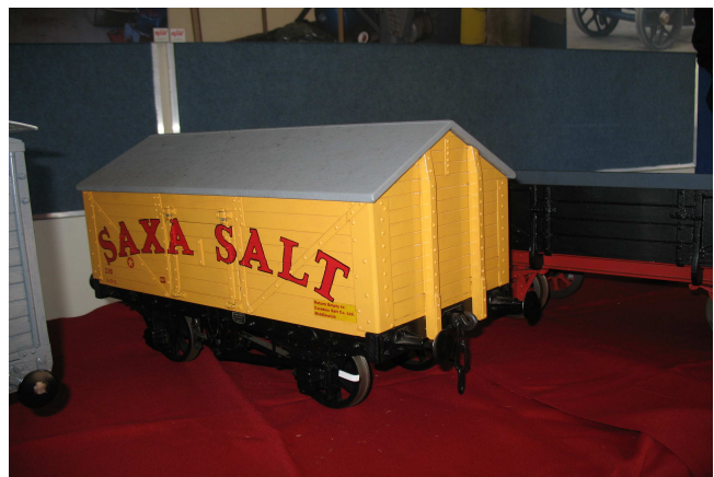
Best piece of rolling stock – C Kirby