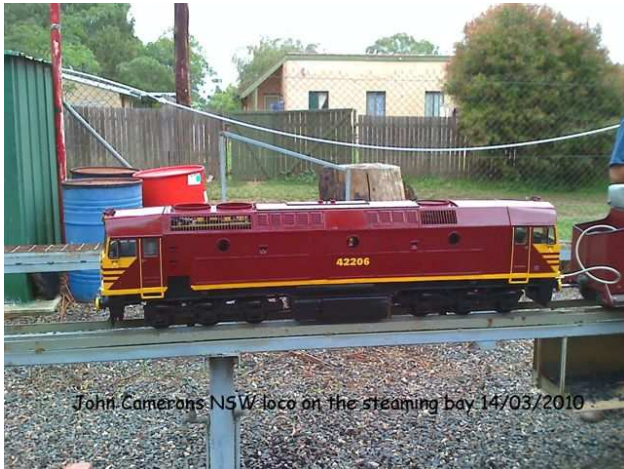
John Cameron's NSW loco on the steaming bay 14/03/2010