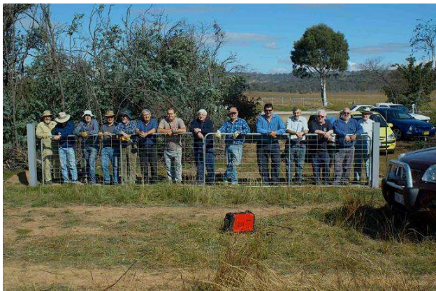
The gates are up at CMR.